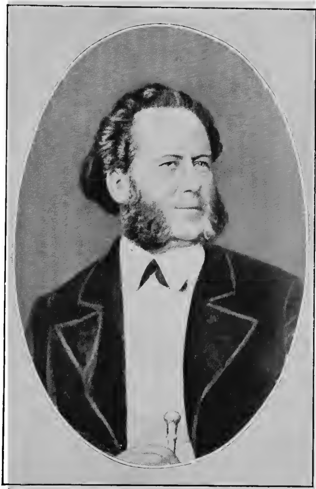
Ibsen in 1868.